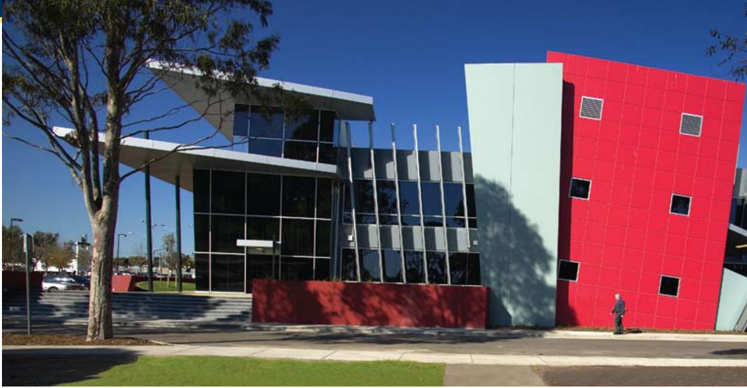
Hume Global Learning Centre