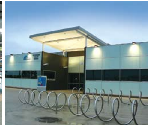
Geelong Leisure Link Aquatic Centre