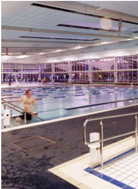
Croydon Sports and Aquatic Centre