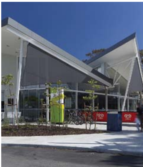
Ascot Vale Sports and Fitness Centre

‘Various user-groups of these types of facilities connect with the community in different ways so it is very important that both the design team and the builder be flexible and responsive ...’